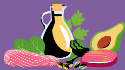
Omega-3 Fatty Acids